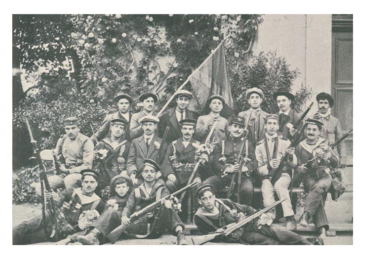
Ilustração Portuguesa, 21 June 1915

Centre]. Most of these armed groups were under the umbrella of the Democratic Party (predictably, the least democratic of all parties), which dominated the electoral machine and acted as a link between the Carbonária and the groups of caciques loyal to the Monarchy. Other civilian armed groups emerged later (after 1911): those with affiliations to revolutionary syndicalism, to Machado Santos, to the catholic students of Coimbra, to the anarchists, to the monarchists, etc.