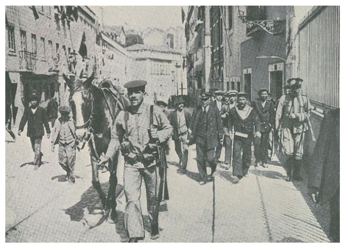
Ilustração Portuguesa, 24 May 1915

These armed groups of civilians were responsible for creating a peculiar military art during the First Republic. Just as it had happened on 5 October - the genesis of these events -, the streets were dominated by the combined action of civilian armed groups and military units, a manoeuvre that was as political as it was military.