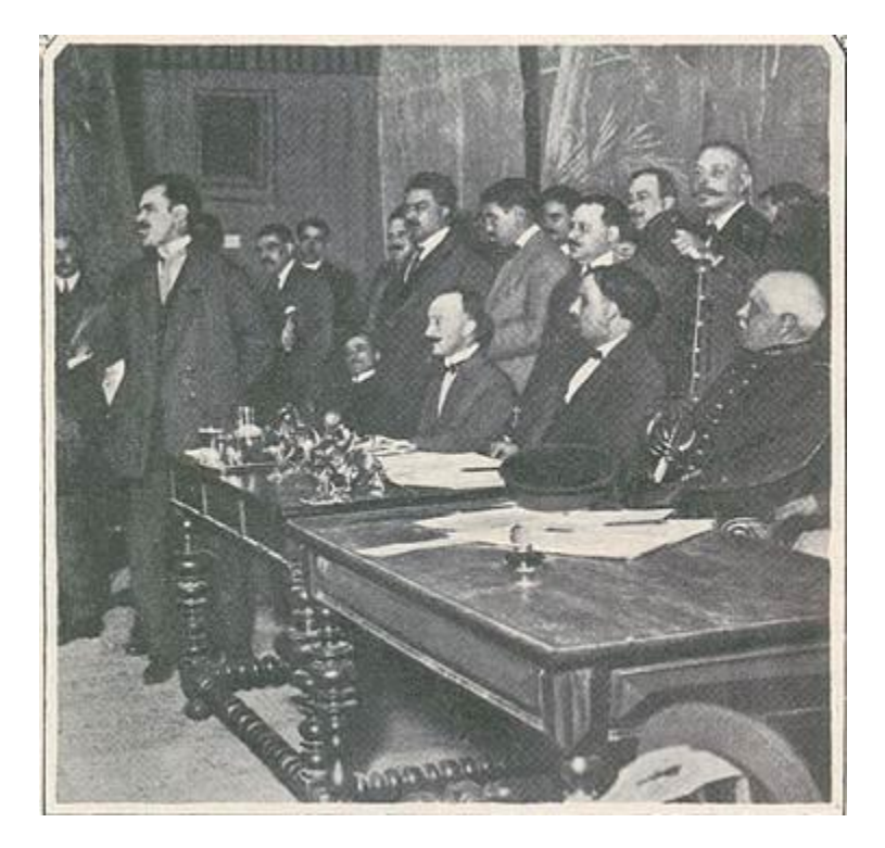
Ilustração Portuguesa, 10 May 1915

Predictably, Portugal soon discovered that it was unable to generate a modern division on such short notice. At the same time, Great Britain encouraged the Portuguese noninterventionists to prevent a forced participation in the war, namely by leaking its secret diplomatic documents to the leader of the opposition (non-interventionist Brito Camacho)<sup>10</sup>. As London expected, Brito Camacho published a series of articles based on the British documents in his newspaper ( A Luta ), denouncing the government's lies. His arguments were simple: Great Britain had not requested the Portuguese involvement in the war and was doing everything in its power to prevent it; the interventionist government wished to pursue it for partisan interests; Portugal should accept all requests made on behalf of the Alliance, but should not insist on belligerency. The non-interventionists, who, contrary to the claims of the interventionist propaganda, were not Germanophiles but friends of Great Britain<sup>11</sup>, made the above the pillars of their policy.